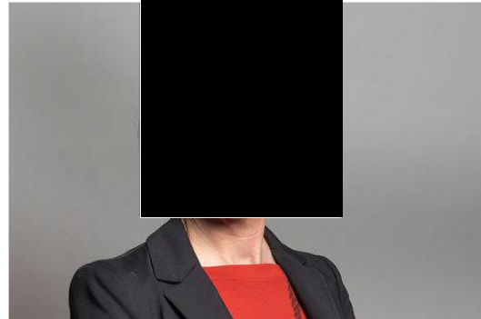
Wendy Morton MP Minister of State for Rail

For the first time in 25 years, we have an opportunity to fundamentally reform our railways. Getting this right means we can ensure this historic industry delivers for its users, setting it on a more sustainable and secure footing. It also means delivering a stronger, more levelled up and increasingly green economy, of which the railways are a crucial part. However, over many years, it has become clear that our railways are not serving passengers, freight users nor the taxpayer well. Spiralling costs, delays to upgrades and commercial failures, including the collapse of franchises and a disastrous timetable change in May 2018, proved this. The issues were stark: too many trains were late, overcrowded or cancelled, meaning that our railways were too often failing in their duty of delivering a high-quality, reliable service for their customers. COVID-19, which exacerbated challenges to the sector's operating model, forced us to confront these long-term trends head on. It's clear that rapid change is necessary, but government cannot deliver this change alone. This consultation seeks to hear from those who use the railway, the wider public and the industry on the proposed legislative changes needed to deliver transformation of the railways.